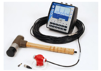
NDE360 Slab IR System