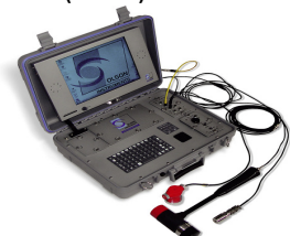
Freedom DataPC Slab IR System

In a Slab IR investigation, the slab top is impacted with an impulse hammer and the response of the slab is monitored by a geophone placed next to the impact point. The hammer input and the receiver output are recorded by a data collection system (Freedom DataPC or NDE360) equipped with the Slab Impulse Response System (SIR-1).