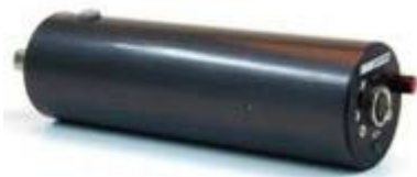
EDm Motor Drive With drive spigot Art No 345 09 223