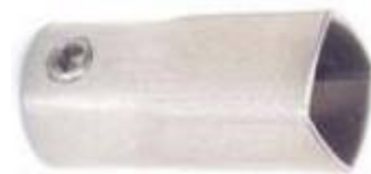
Drive Spigot For EDM Art No 345 09 228