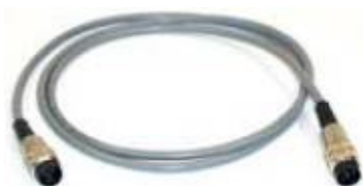
Connecting Cable EDM/EDm BC Art No 345 09 226