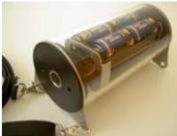
EDm BC Battery Holder With Carry Strap Art No 345 09 224