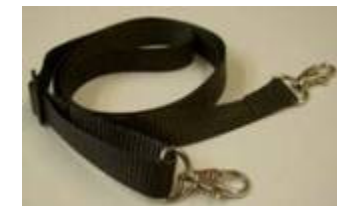
Carrying Strap For EDM BC Art No 345 09 229