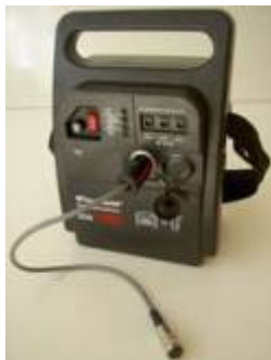
EGS 1800 Power Station Art No 345 09 225