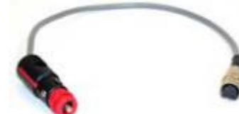
Adaptor Cable For EGS 1800 Art No 345 09 227