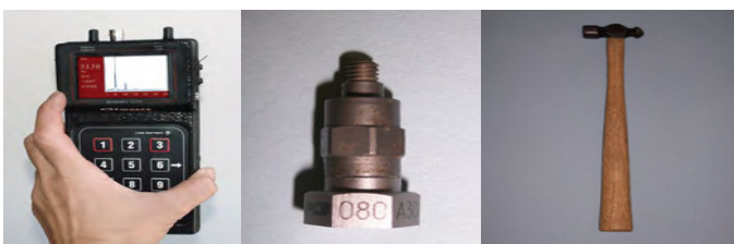
Data Acquisition Unit Accelerometer Ball-Peen Hammer

A series of three tests must be taken longitudinal, transverse and torsional arrangements. The accelerometer is simply mounted to the test specimen by glue or grease and is then placed on the rubber pad. Then the unit is turned on and the specimen is then struck with the hammer and the results are recorded and saved for analysis.