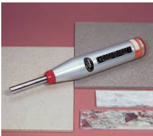
SCHMIDT Hammer Type L

Also with a measuring range 10 to 70MPa compressive strength, this hammer has an impact-energy, which is three times smaller than the Type N. These types are used for testing thin walled (< 100 mm) or small components but also cast stone components sensitive to impact.