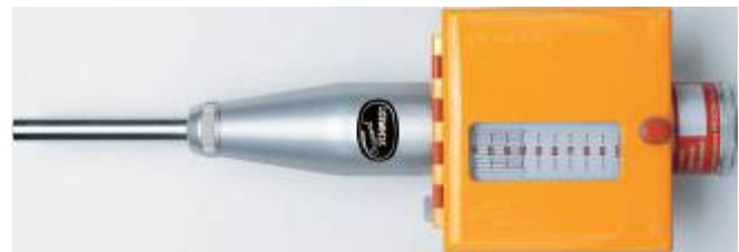
SCHMIDT Hammer Type *R

With this model Rebound values are recorded as a bar chart on a paper strip. One roll of paper strip offers room for 4000 test impacts.