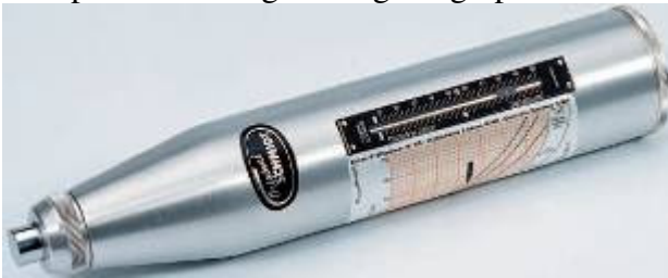
SCHMIDT Hammer Type N

This is the workhorse of the range. With a measuring range 10 to 70 MPa compressive strength and impact energy of 2.2J, this hammer is sufficient for most engineering applications. Rebound values are read from a dial and converted to compressive strength using the graphic above it.