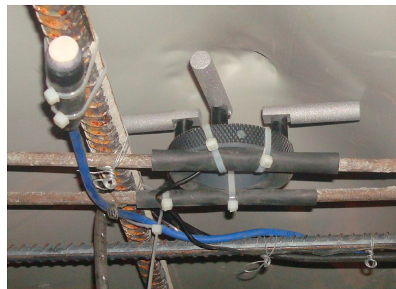
Figure 3. Recommended installation mounted on the reinforcement net. The CorroWatch probe is mounted in combination with an ERE-20 reference-electrode (blue cable).

The cables from the CorroWatch probe and the ERE-20 reference-electrode are joined and conducted to the concrete surface. To protect against casting damage, it might be advantageous to conduct the cables in conduits.